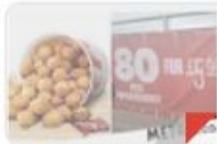
Screenshot 2020-05-... Image

I like this advert because KFC popcorn chicken is one of my favourite foods and now you can buy a big sharing bucket and share with your family. Their slogan finger licking good is very catchy. You get 80 pieces of popcorn chicken for £5.99 which is a good price and would make people want to buy it.